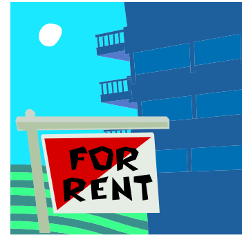
Financing Dreams One Home at a Time

The saying, "anything worthwhile is usually hard work" is very true. Sometimes you have to work and wait a long time for the results of your hard work to pay off. I know of what I speak from personal experience. I'm referring to ownership in investment properties. My husband and I have had apartment houses for over 30 years. They all have been older homes where the upstairs level was converted into a one or two bedroom apartment; the main floor having two or three bedrooms.